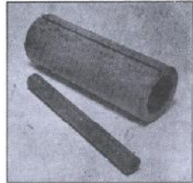
Minrock ® Pipe Section Conforming to IS 9842

Minrock rockwool SPI products are available for hot face temperatures upto 750°C. Minrock rockwool SPI are supplied as one - piece sections of one metre length, upto 4" N.B. and with slit along the longitudinal axis in two sections for 4" N.B. and above. Sections are easily installed by opening the slit and springing the section into position over the pipe.